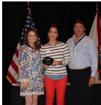
$1 Million+ Panama City Beach