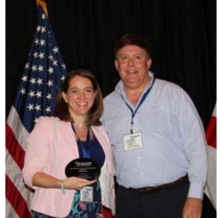
$1 Million+ Lakeland Area