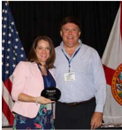
$1 Million+ Lakeland Area