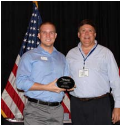
$1 Million+ Panama City Beach