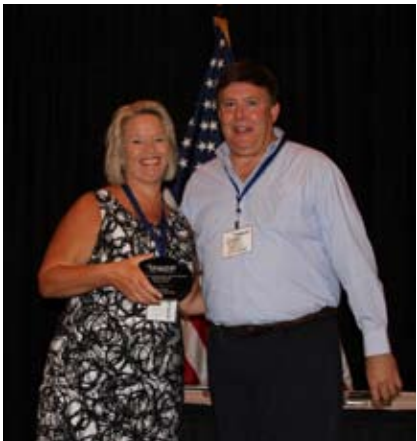
$500K-$999K Category Bay County