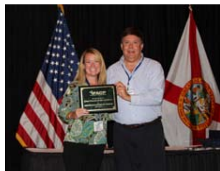
Certified Plus Pensacola