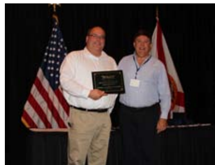
Certified Plus Miramar-Pembroke Pines