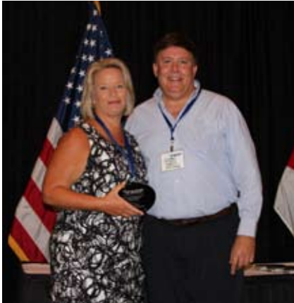
$500K-$999K Category Bay County