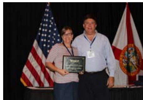
Certified Flagler County