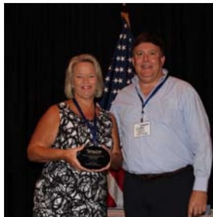
$500K-$999K Category Bay County